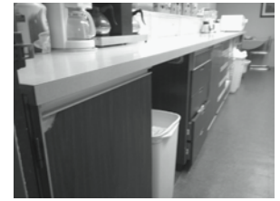
Old pharmacy counters